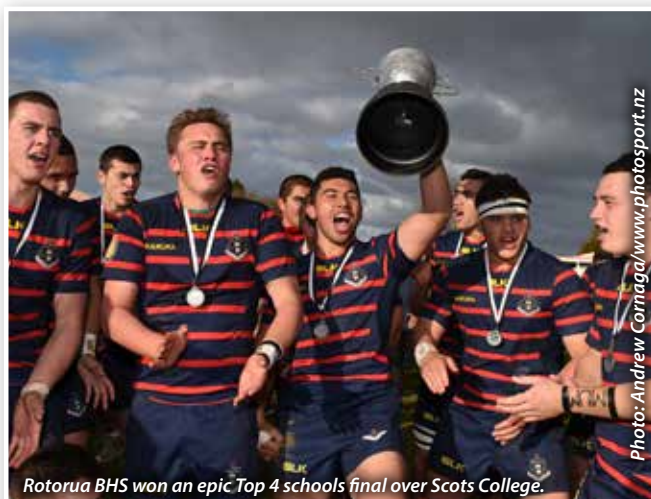
Rotorua BHS won an epic Top 4 schools final over Scots College.

For a full report of the weekend, click here: http://www.barbarianrugby.co.nz/secondaryschools.html