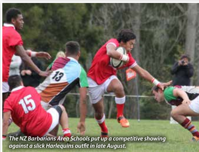
The NZ Barbarians Area Schools put up a competitive showing against a slick Harlequins outfit in late August.

http://www.barbarianrugby.co.nz/national.html