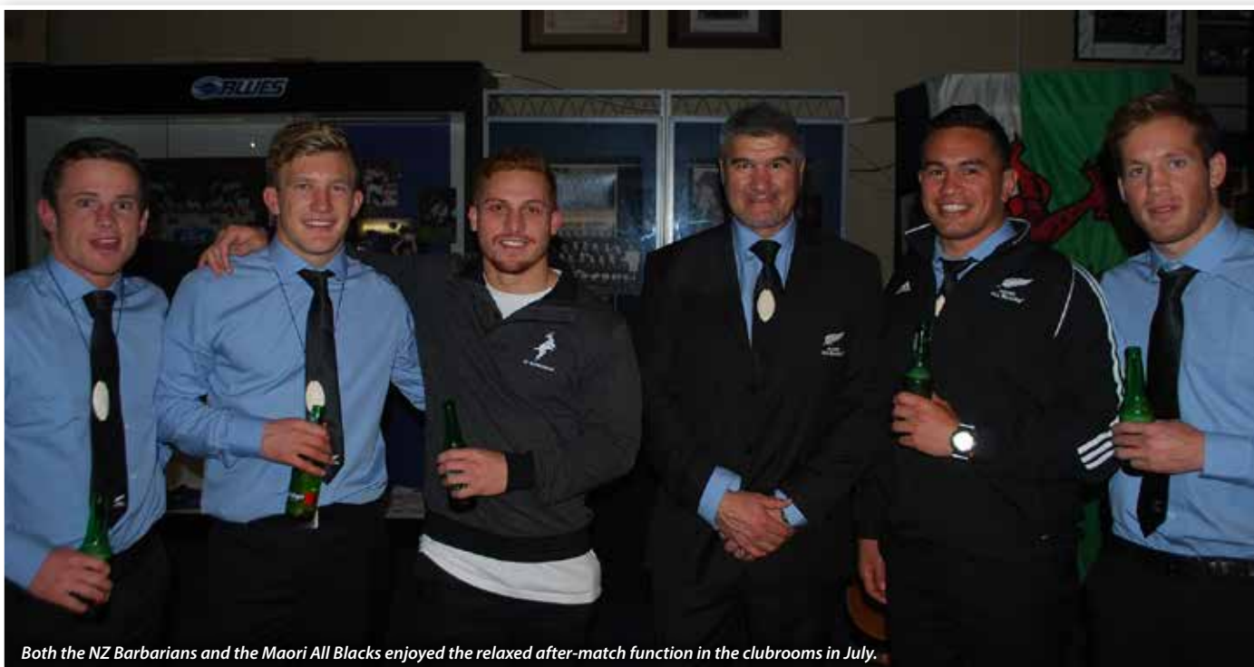
Both the NZ Barbarians and the Maori All Blacks enjoyed the relaxed after-match function in the clubrooms in July.